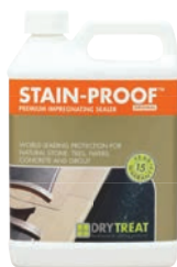
Dry-Treat™ STAIN-PROOF™ Original