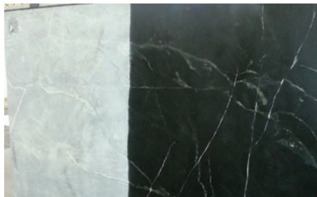
Bring out the color of soapstone