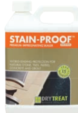
Dry-Treat™ STAIN-PROOF™ Original