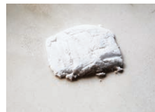
Poultice made from Oxy-Klenza™