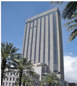
Precast concrete facade treated with 40SK

**If applied by an accredited applicator