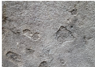
Protect from freeze-thaw spalling